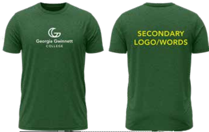
GGC logo on front and secondary logo/words on back.