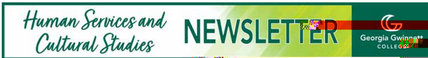
Department name to the left of the word NEWSLETTER with GGC logo on far right reversed out of green background.